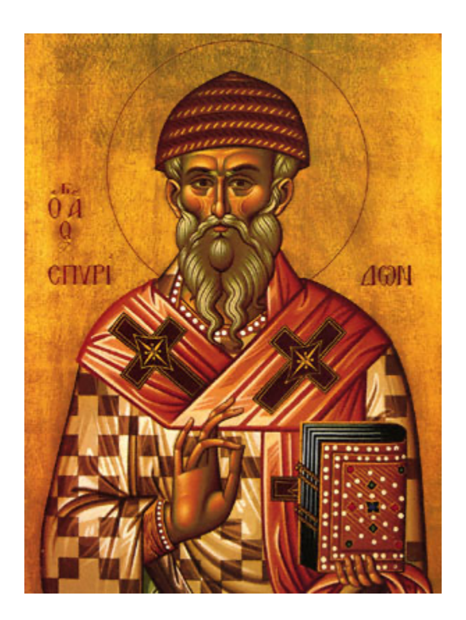
SUNDAY, DECEMBER 12, 2021