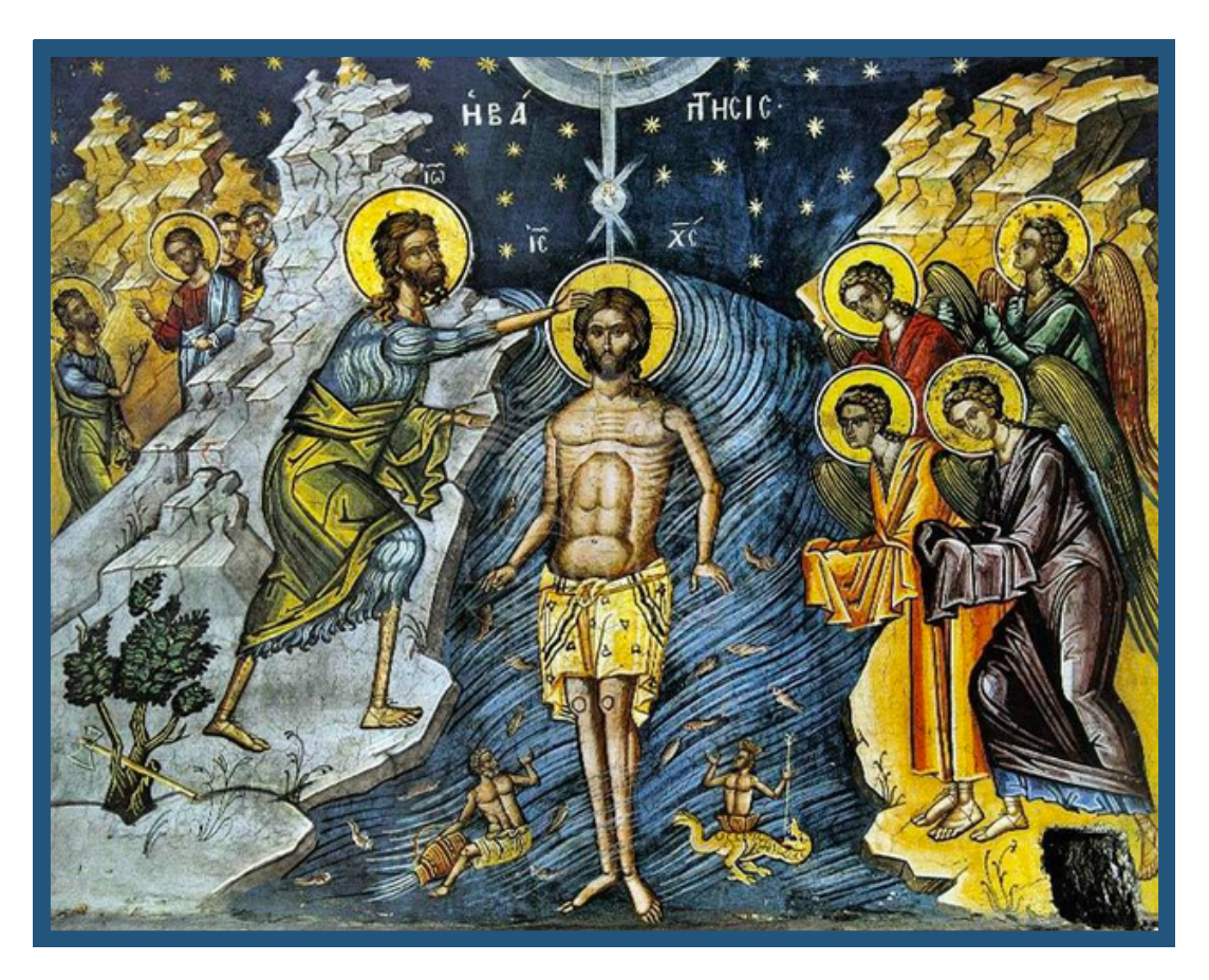
Leave-Taking of the Feast of Theophany January 14, 2024