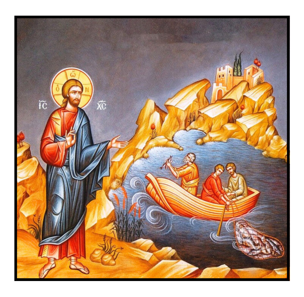
THE SECOND SUNDAY OF MATTHEW JUNE 22, 2025