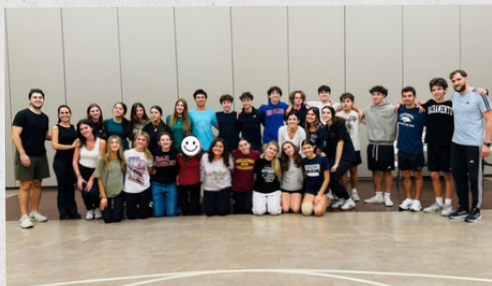
Fall Workshops - 2025