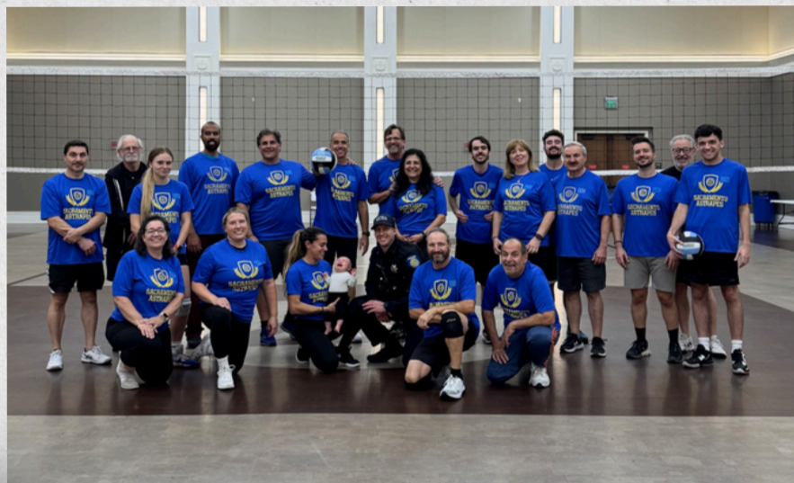
CONGRATS ON A GREAT SEASON!