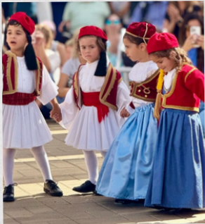
Ta Mikra dancing at Greek Festival 2025

As the season progresses, we look forward with excitement to watching these suites come to life at our February showcase, Ελληνική βραδιά, and at FDF in Phoenix, Arizona. We extend our heartfelt thanks to our Annunciation community for the constant encouragement and support that sustains this vibrant ministry.