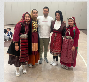
Fall Workshops - 2025