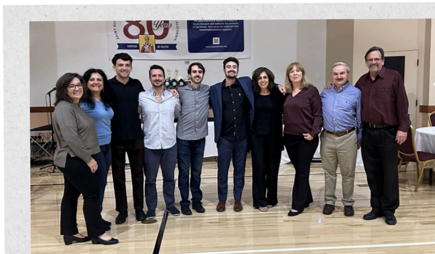
2025 St. Nicholas Volleyball Tournament San Jose, CA - October 17-19