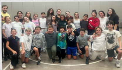
Fall Workshops - 2025