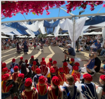
Ta Mikra & Ta Kamaria watching Ta Koukounaria dancing at Greek Festival 2025