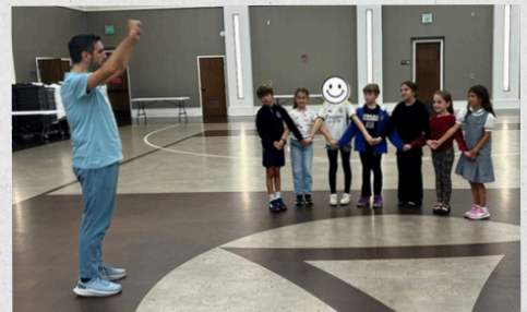
Fall Workshops - 2025